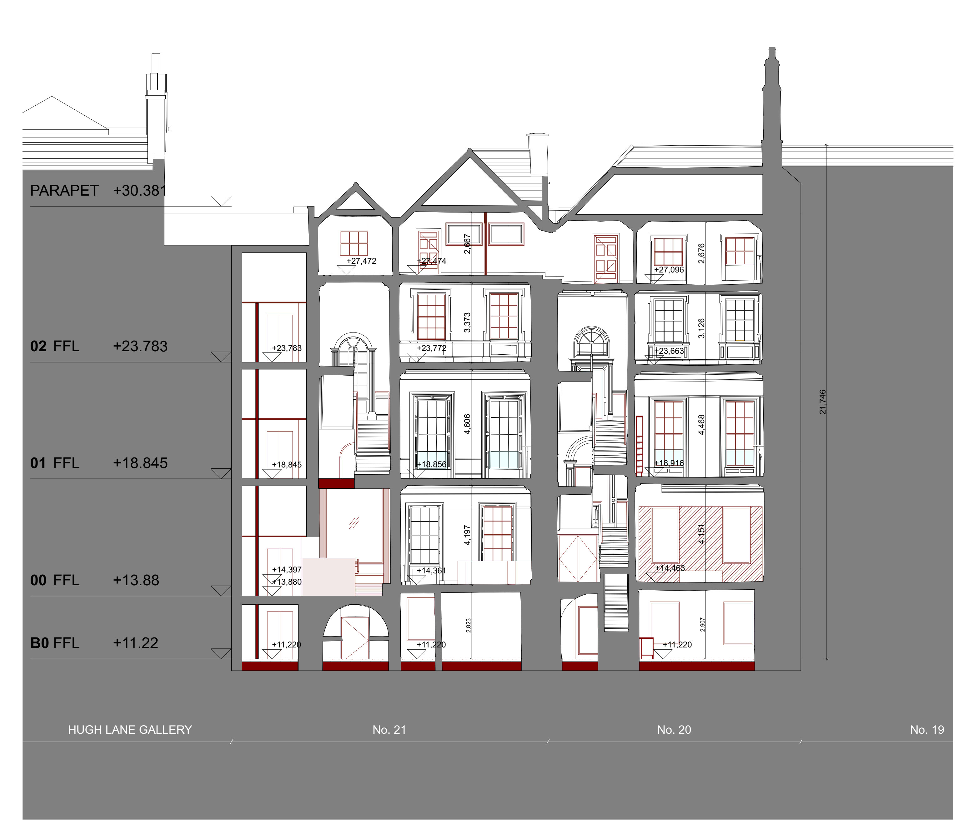
Proposed Section N